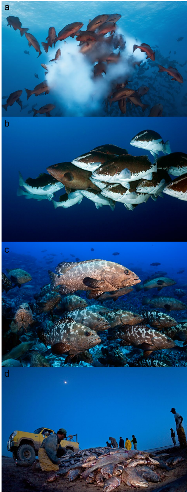
Figure 1. (a) Spawning in twin-spot snapper ( Lutjanus bohar ) in Palau, showing massive and highly concentrated release of eggs which occurs predictably over just a few hours each year. (b) A spawning group of endangered Nassau grouper

that fish far exceeded fishing effort. Aggregate-spawning species, from subsistence to small-scale/artisanal to industrial-scale fisheries, are of great economic and food security value, so it is of utmost importance to understand the impact of aggregation-fishing on such species and how this can best be managed. Of the top 20 fishes by weight supplying global fisheries (FAO 2014), many undergo regular spawning migrations, aggregate to spawn, and are exploited at these times. Examples range from Alaska (walleye) pollock ( Theragra chalcogramma ), Atlantic cod ( Gadus morhua ), capelin ( Mallotus villosus ), and Atlantic mackerel ( Scomber scombrus ) to largehead hairtail ( Trichiurus lepturus ), European pilchard ( Sardina pilchardus ), and herring.